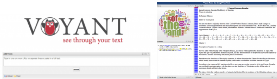
Fig 1 & 2. Voyant home screen, Voyant interior.

If you are looking to do in-depth textual analysis, Voyant Tools offers a great web-based text reading and analysis environment. Though the site appears simple, uploading a text reveals a much more complex interface that can be difficult to parse at first glance. Companion site Voyant Tools Documentation offers a fantastic, step-by-step exploration of the Voyant tools' potential uses.